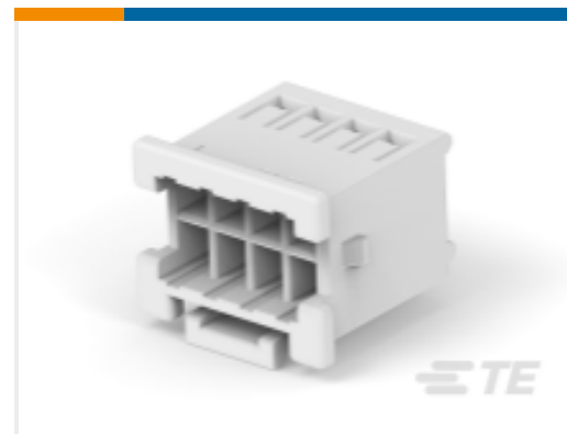
TE Part # 1969567-8 HOUSING, PLUG, GWT, DUAL ROW, EP2.5